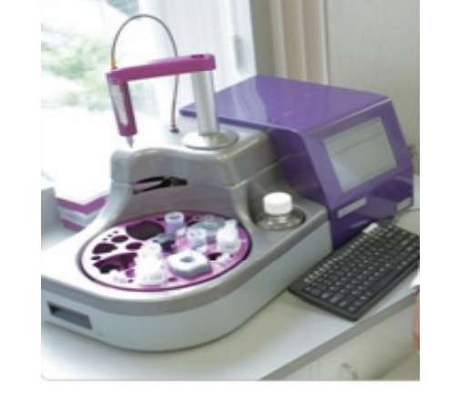
Figure 1. Inside view of RoboSep

Magnetic bead separation of T and B lymphocytes has been used in tissue typing laboratories for many years. We evaluated a new method of cell extraction using EasySep beads and the automated robotic instrument (Figure 1, StemCell Technologies). The RoboSep system can process 4 samples simultaneously requiring minimal manual set-up. This was compared to our current manual Dynabead method (Dynal).