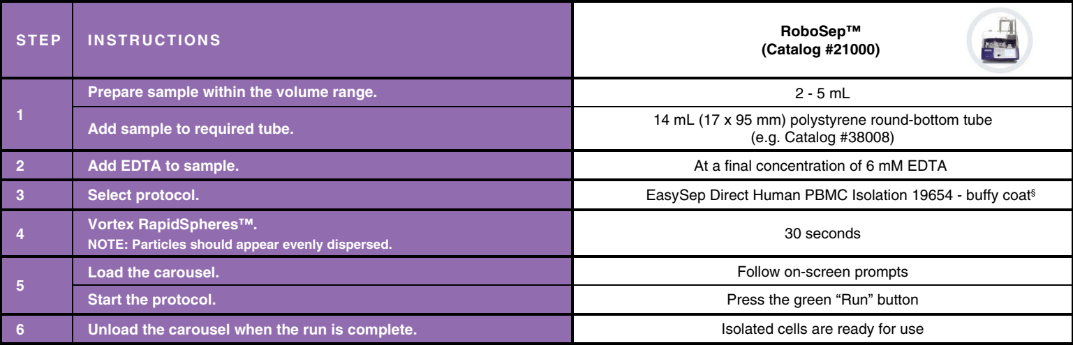
Table 4. RoboSep™ Direct Human PBMC Isolation Kit Protocol for BUFFY COAT

NOTE: If using RoboSep™-S, ensure the software is at least v.1.2.0.2 and a carousel compatible with this product is installed. Contact us at techsupport@stemcell.com for more information.